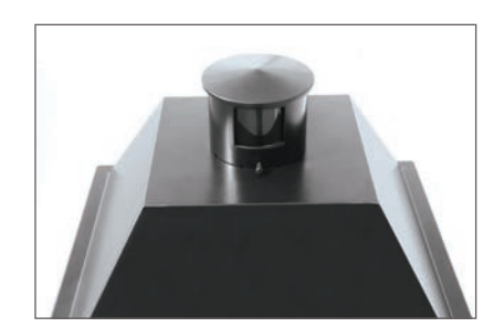
Cast aluminum roof with rotatable photocell receptacle and cover.