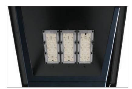
IP66 sealed LED modules (1-4 modules available)