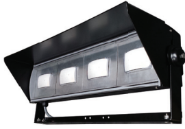
Extended Glare Shield (EGS)