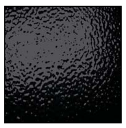
GTB Gloss Textured Black