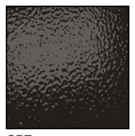
GBZ Gloss Textured Bronze