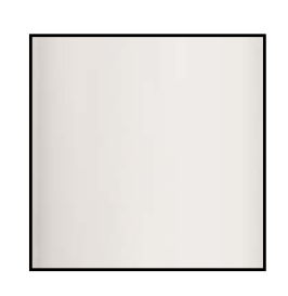
WHT Gloss White